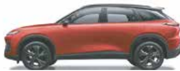
Metallized red colour