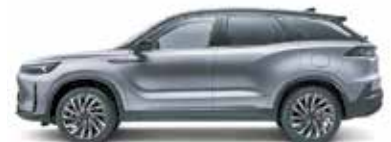
Dark grey metallic + black roof