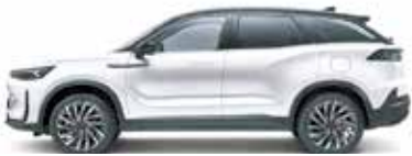
Pearl white + red roof

Extra cost for colour (free metallic red)