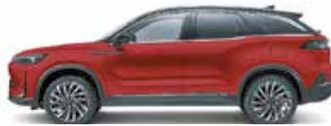
Red metallic + black roof (without paint)