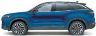
Blue metallic + black roof