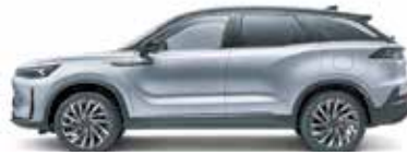
Silver metallic + black roof